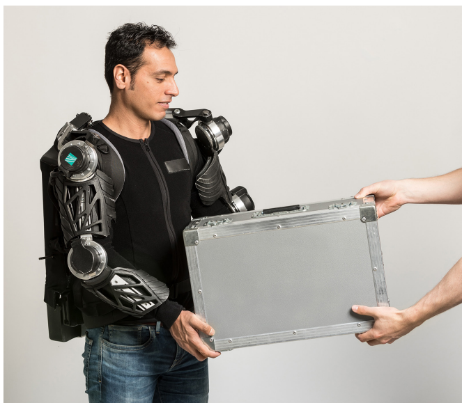
The experts have integrated drive modules at the elbows and shoulders to support high-torque movements.