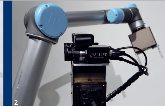
1 rob@work 3.