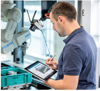
Setup of the system