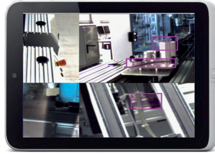
Tracking and feature extraction